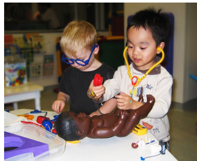
Graphic from Australian Association

Be patient as it is not uncommon for preschoolers to regress a bit surrounding a hospital experience.