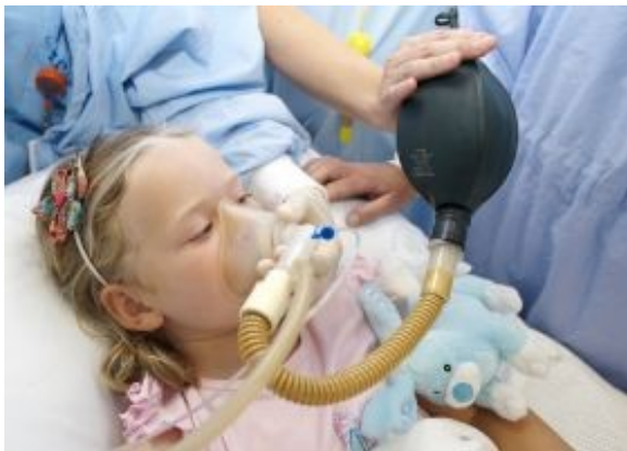
Graphic: Department of Anaesthesia at The Children's Hospital at Westmead

Regional anaesthesia is used in combination with general anaesthesia so your child will be relaxed, comfortable, and have no memory of the procedure.